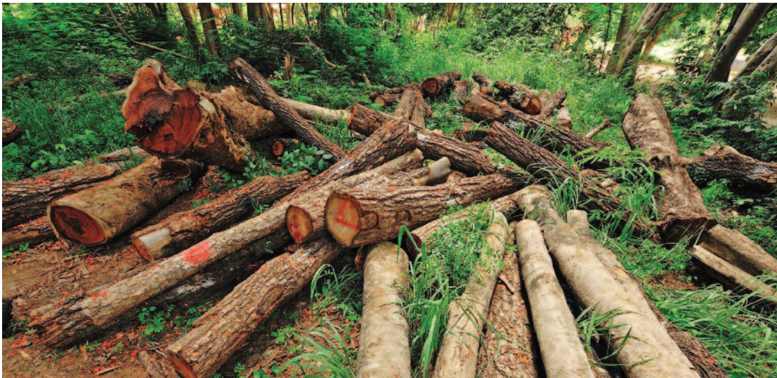
Felled timber in Thailand.