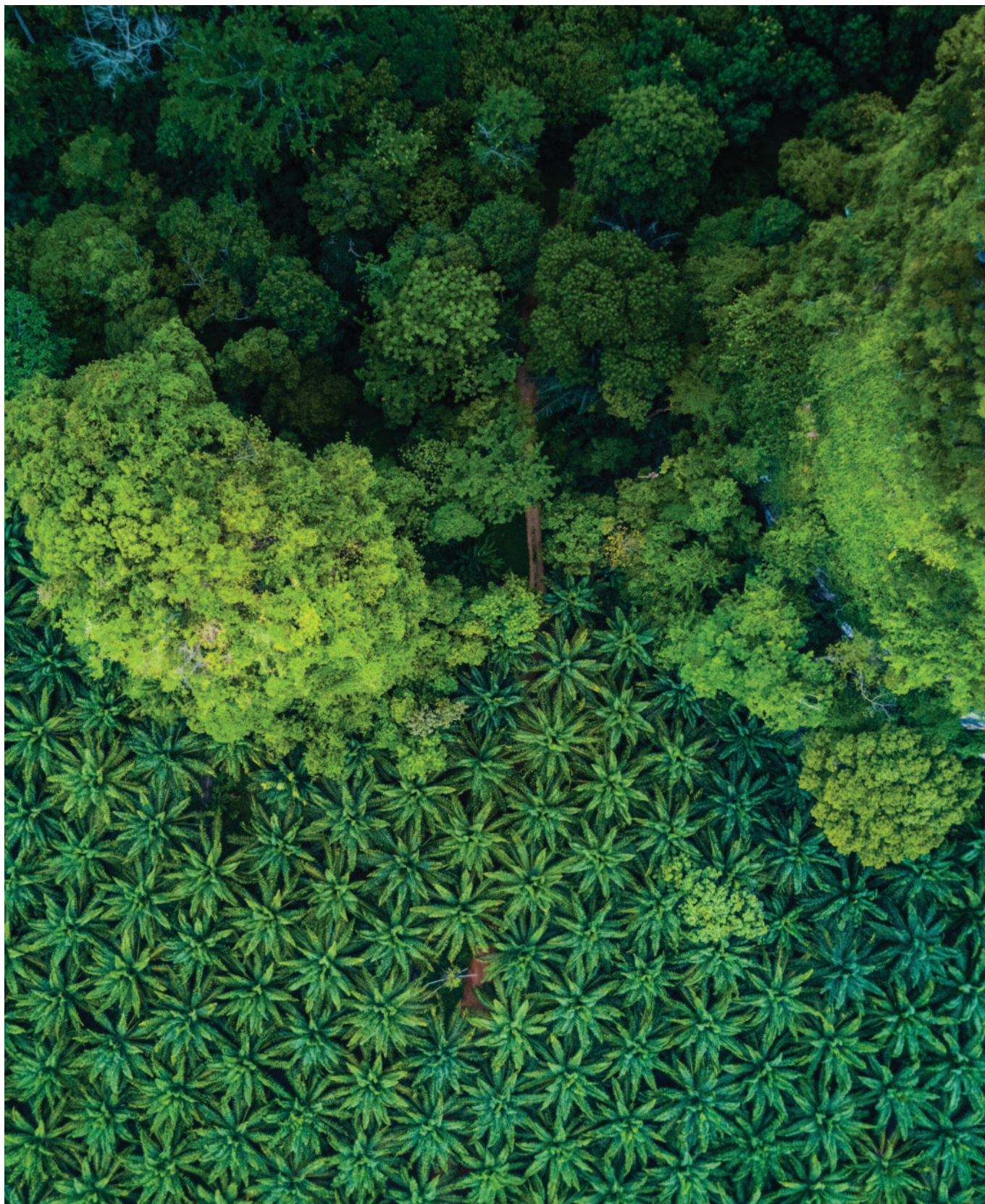
Oil palm plantation in Goa, India.