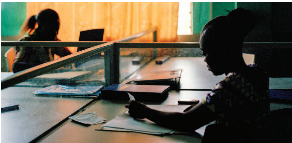
Paralegals at work, Sierra Leone.

Interviewees also mentioned other reasons for the regular failure of governments to conduct adequate preparations. These included resource and skills shortages, 114 investors receiving special treatment when “connected” to senior government officials, 115 and governments being “desperate” for investments. 116 One embedded legal support provider noted that, in her experience, the government did not undertake any feasibility studies, environmental assessments, or other technical research in advance of negotiations. Nor did the government try to speak to communities residing on the land in question, or require companies to do so, as all land was considered to belong to the government. The interviewee was aware of only one company that sought to receive informed consent from communities, at the insistence of one of the company’s sustainability officers. 117