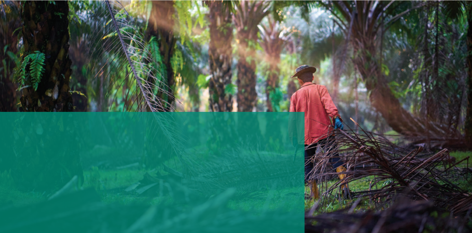
Oil palm plantation in Malaysia.