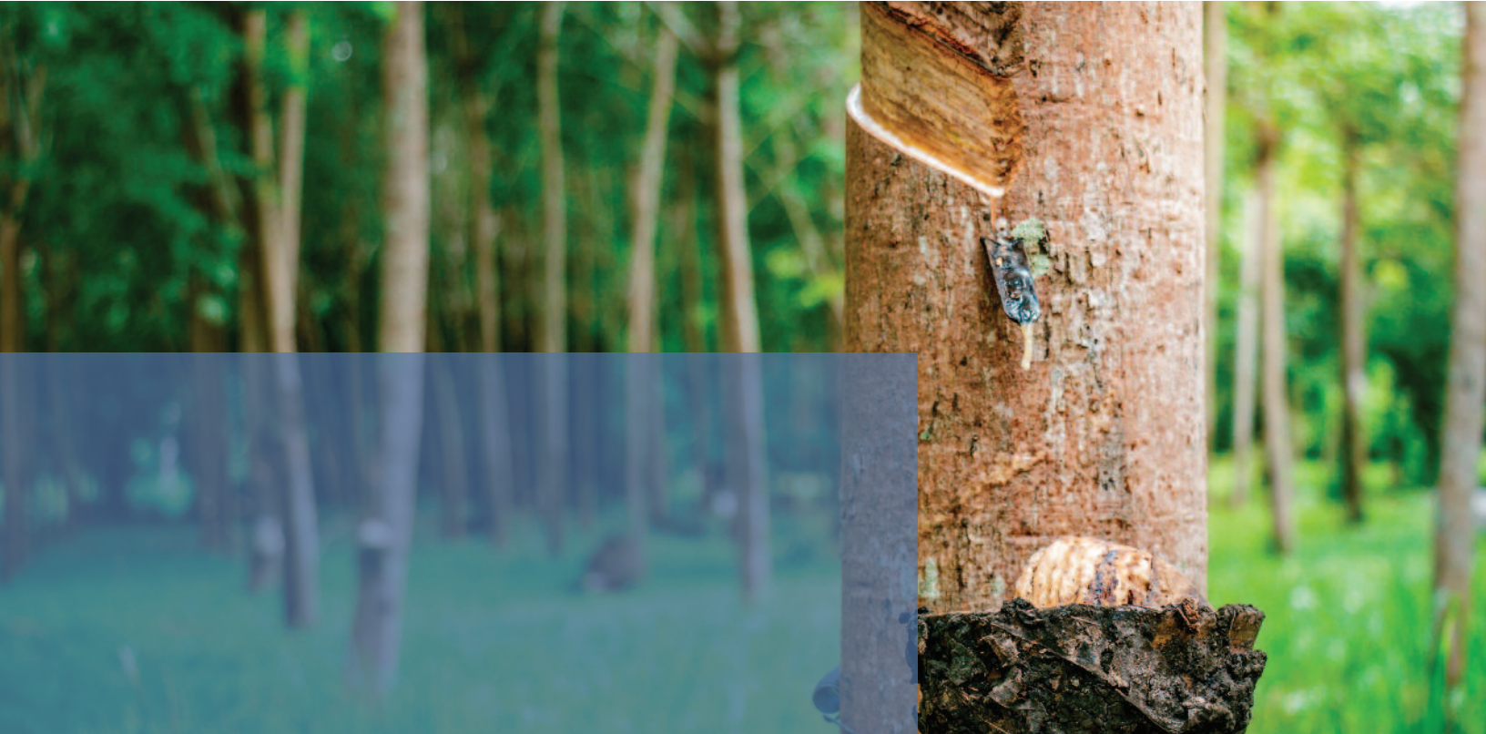
Rubber tree plantation in Koh Samui, Thailand.