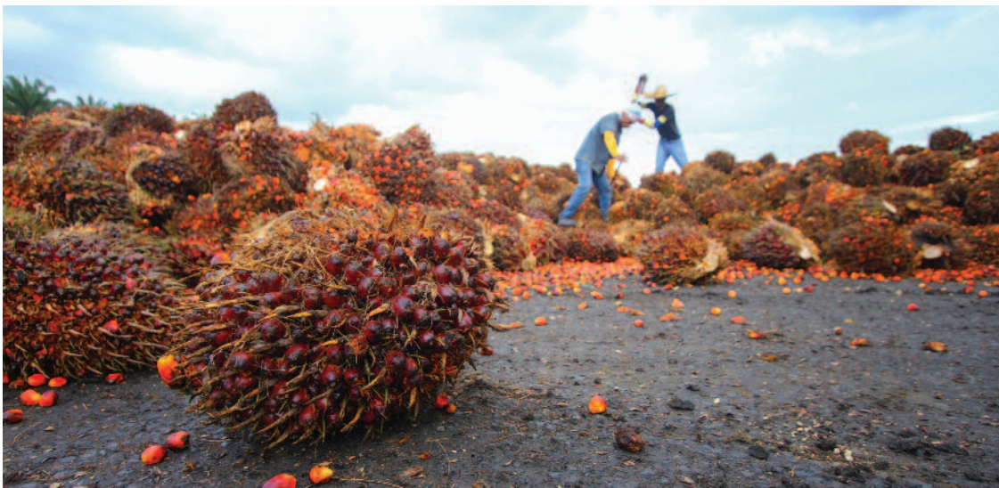
Workers harvest oil palm fruit in Malaysia.

Governments sometimes negotiate contracts with only minimal participation by lawyers. 160 This is often problematic, given that lawyers have essential skills that are relevant both in drafting clear legal language and in assessing the potential risks and issues that may arise from legally binding agreements. One legal support provider who was embedded within a government ministry for a significant period of time expressed frustration at the government’s limited knowledge of how to relate to investors and how to efficiently negotiate a deal that was beneficial to both the investor and the government. 161