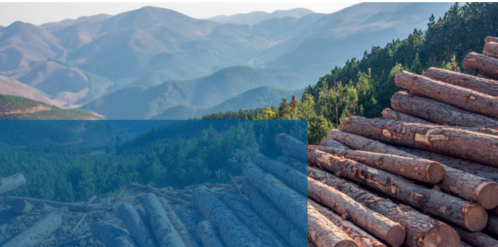
Felled timber in South Africa's border region near Swaziland.