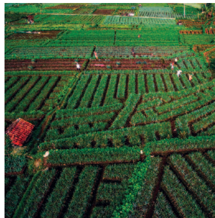
Farmers working in onion plantations in Argapura, Indonesia.

A final weakness of governments at the implementation and monitoring stage concerns dispute resolution. One government representative noted that many disputes between governments and investors often have the potential to be resolved amicably, when the government has the confidence and capacity to understand the grievance and devise an appropriate response. 240 Legal support can help governments in this regard, by assisting governments to pursue any breaches of the contract by the investor, including potentially by enforcing penalties under the contract or the country's legal framework. Lawyers can also advise governments on the potential consequences of government breaches (including the potential for liability from costly investor-state dispute settlement arbitrations under a bilateral investment treaty) and on what action to take to remedy breaches and negotiate settlements with investors. Yet where governments lack skills and experience and do not seek legal advice, they may take actions that inflame rather than resolve disputes, increasing the chances that disputes will escalate to costly dispute resolution processes. 241 Two interviewees with experience in government also noted that states require external legal counsel for dispute resolution, including if the dispute is referred to investor-state dispute settlement. 242