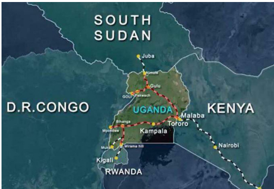
A map showing SGR lines in Uganda. Only those in the project area shall be affected and not everybody.