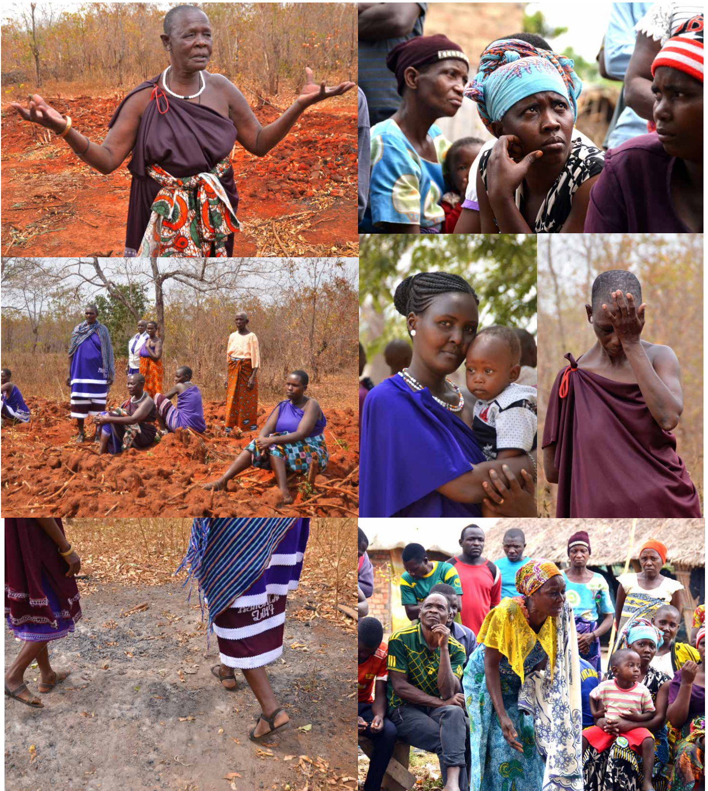
The many faces and emotions of eviction