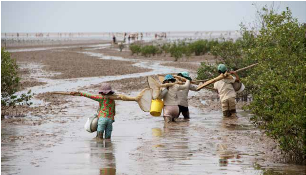
Clam collection in sandbank beyond mangroves.

This assessment provides a synoptic analysis of the legal and governance frameworks that relate to the use and management of mangrove forests globally. It highlights the range of challenges typically encountered in the governance and tenure dimensions of mangrove forest management. This assessment forms part of a broader study that includes national-level assessments in Indonesia and Tanzania. It was carried out under the USAID-funded Tenure and Global Climate Change Program.