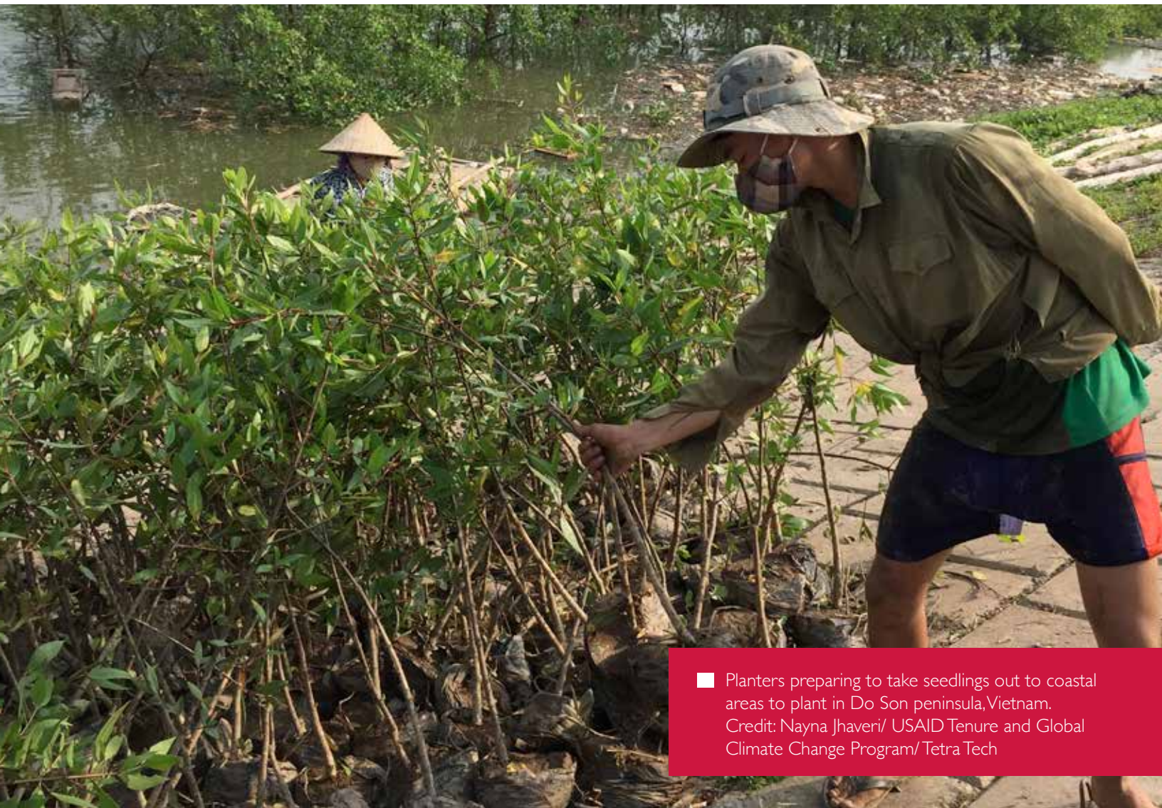
■ Planters preparing to take seedlings out to coastal areas to plant in Do Son peninsula, Vietnam.