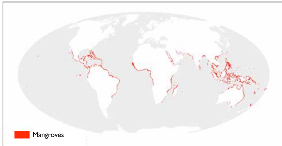
Figure 1. Global map of mangrove forests