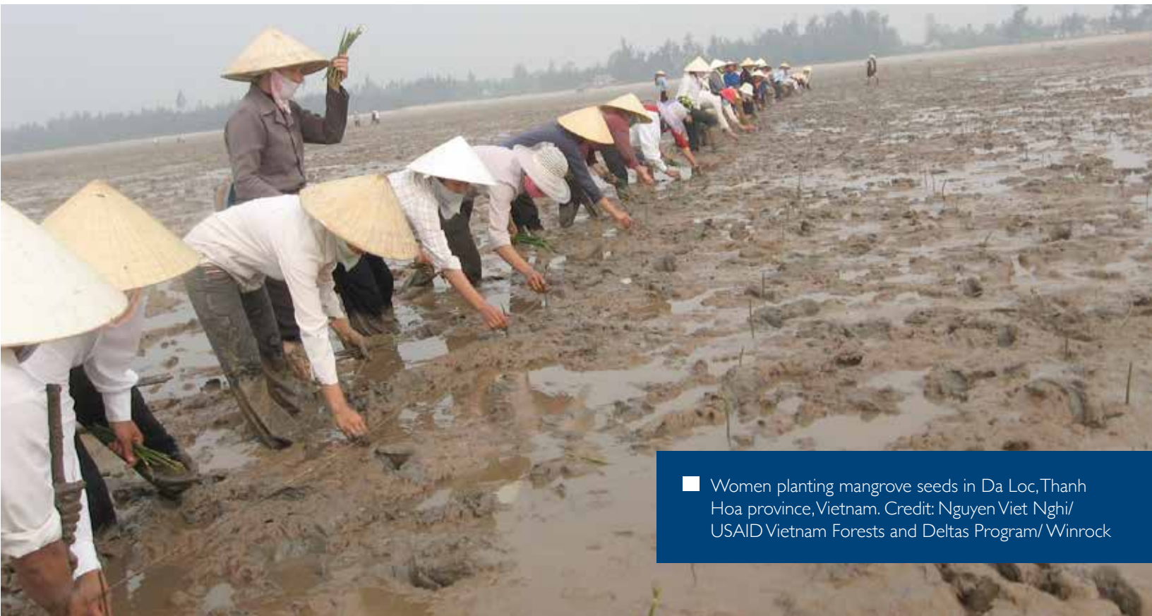
■ Women planting mangrove seeds in Da Loc, Thanh Hoa province, Vietnam.

A study conducted in Honda Bay, Palawan, in the Philippines, showed different valuation by men and women of mangrove products for their livelihoods. Women placed a higher value on the sea cucumbers, shells, and invertebrates supported by mangroves in the intertidal zones, while men valued fish living in offshore reefs. Men's preferences tend to be perceived as more important and women's fishing needs are seen as secondary, leading to the marginalization of women, and negatively affecting biodiversity conservation (Siar, 2003).