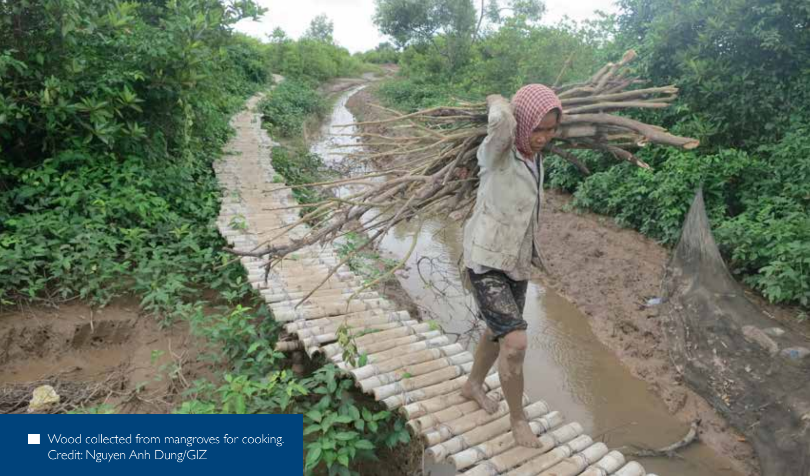
■ Wood collected from mangroves for cooking.

institutions (Van Lavieren et al., 2012). The same type of devolution seen in terrestrial forestry settings, leading to what can broadly be called “community-based forestry management,” is now gathering steam within mangroves. Experimentation in mangrove management is increasing; various kinds and ranges of rights have been granted to lower-level entities, including households and communities.