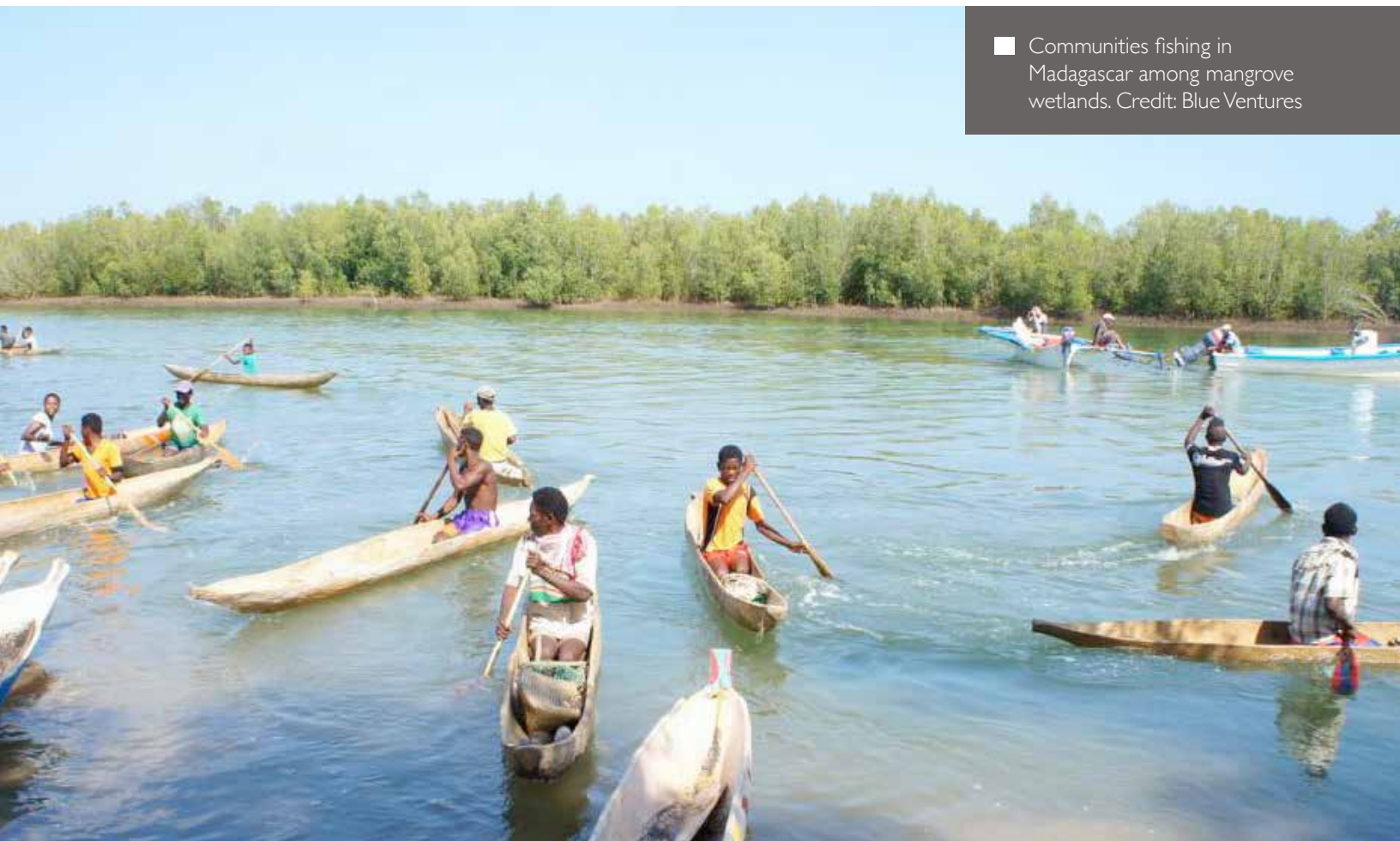
■ Communities fishing in Madagascar among mangrove wetlands.

Approximately 14.2 percent of all mangroves worldwide (Schmitt et al., 2009) contribute to the global protected areas system, some of which are found in the above-mentioned countries where mangrove protection is the main policy objective. In Brazil, for example, more than 82 percent of the country’s mangroves are located within protected areas (IUCN Categories I–VI), with many of them permitting sustainable harvesting of resources (Gravez, Bensted-Smith, Heylings & Gregoire