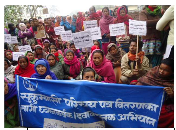
Campaign for the distribution of Identity card for landless people