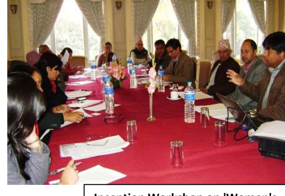
Inception Workshop on 'Women's Access to Land and Land Grabbing'

CSRC is conducting a study on 'Women's Access to Land and Land Grabbing' in collaboration with NLRF. The study is being supported by Oxfam being focused on Jogbudha of Dadeldhura, Paduka of Dailekh and Saahare of Surkhet respectively. Besides this other districts have been selected as per the collection of impact case study. Following this an Inception Workshop was carried out on 21 December, 2012 with the participation of