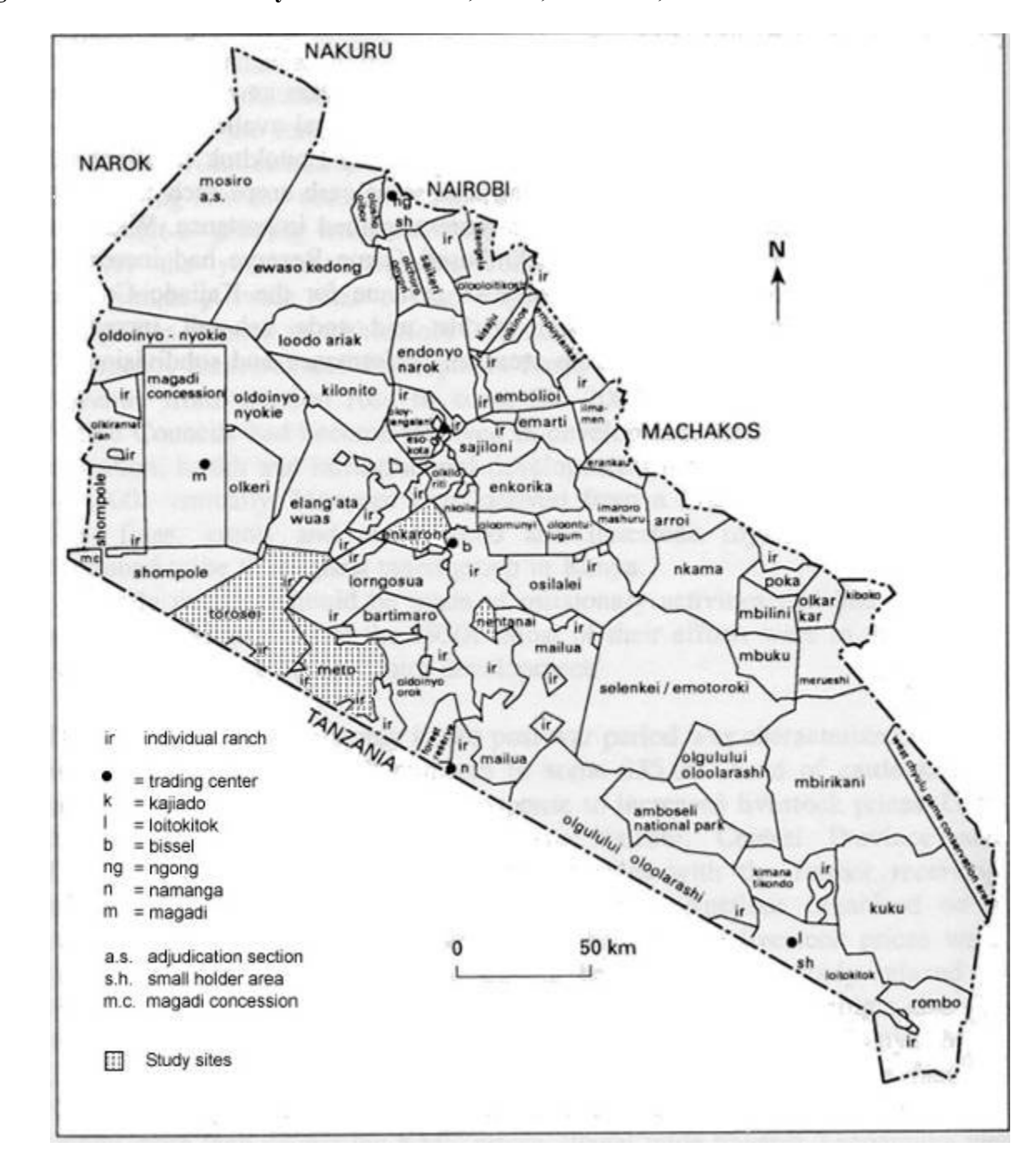
Figure 2-- Location of study sites: Enkaroni, Meto, Nentanai, Torosei