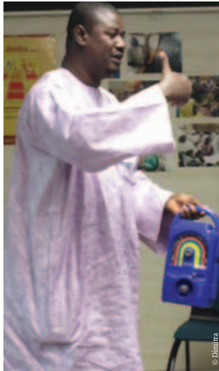
Dimitra organised a talk show at the Fair to present its community listeners’ clubs in Niger and the Democratic Republic of Congo.

Another session was facilitated by FAO’s Capitalisation of good practices project (part of the Belgium-funded Knowledge Management and Gender Programme) and discussed how inventory credit (warrantage) can be made equally accessible to both women and men, especially the most vulnerable. Experiences in Burkina Faso and Niger were illustrated. And a session on savings as a springboard to market readiness showed the dynamic force of rural women’s savings groups in Central America for moving women from ‘market-limited’ to