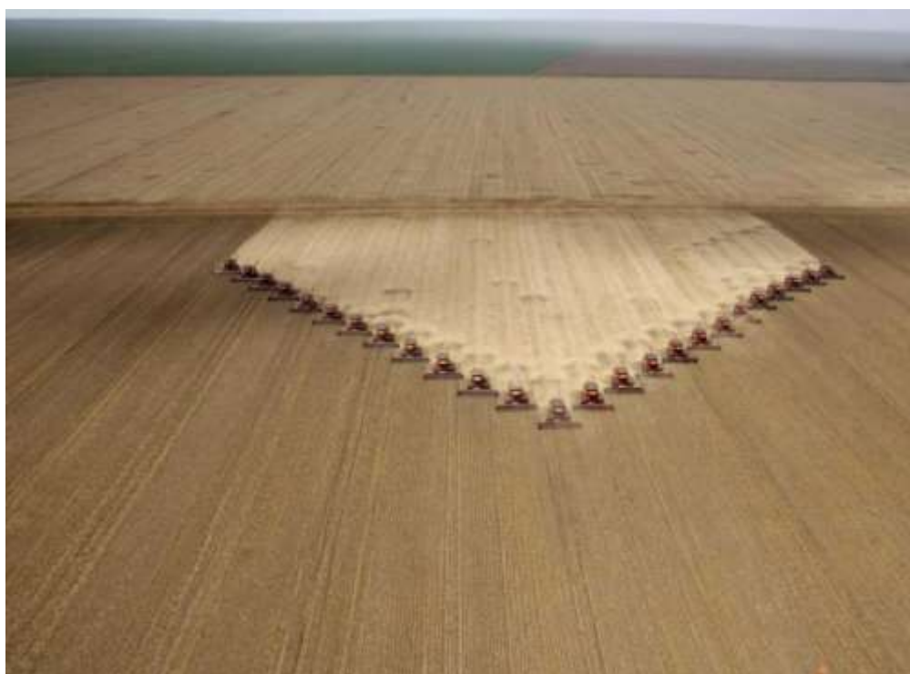
The primary concern for big corporate farms like this soybean plantation is their return on investment, which is maximised at low levels of spending and thus often implies less intensive use of the land

In a recent paper on small farmers and agroecology, the UN Special Rapporteur on the Right to Food concludes that global food production could be doubled within a decade if the right policies towards small farmers and traditional farming were implemented. Reviewing the currently available scientific