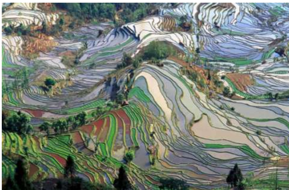
Rice terraces in Yuanyang County, China

Farmers, and more so small farmers, carry out a wide range of agricultural activities under quite diverse arrangements. These include