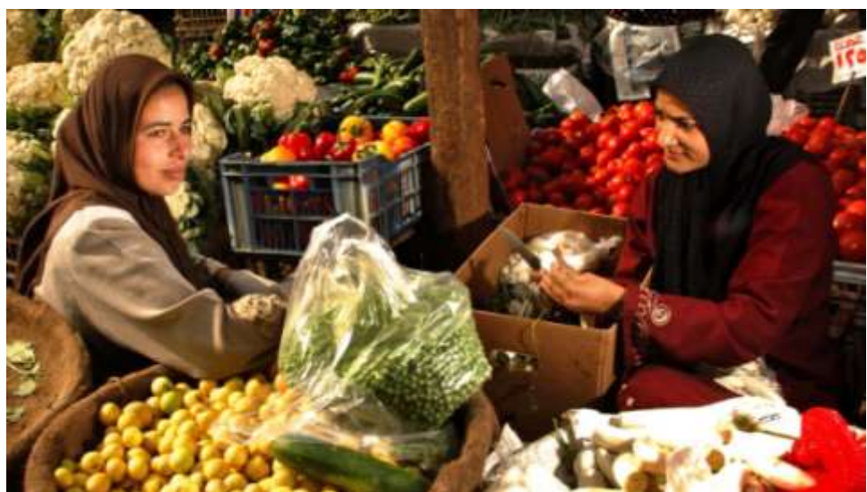
Farmers market in Turkey: the role of women in feeding the world is not adequately captured by official data and statistical tools.

If this land concentration process continues, then no matter how hard-working, efficient and productive they are, small farmers will not be able to carry on. The concentration of fertile agricultural land in fewer and fewer hands is