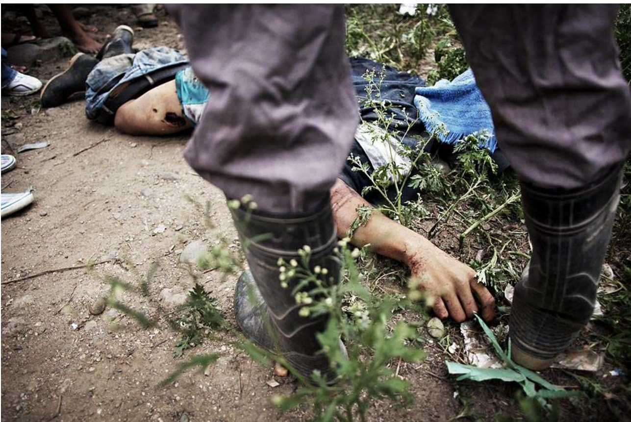
A killing of a campesino in Bajo Aguán, Honduras.

Rural people don't simply make a living off the land, after all. Their land and territories are the backbone of their identities, their cultural landscape and their source of well-being. Yet land is being taken away from them and