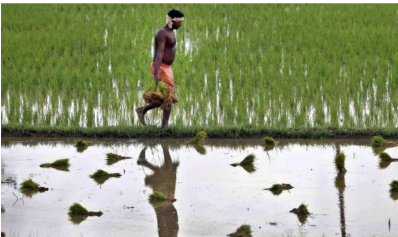
Flooded paddy in Orissa: the average farm size in India roughly halved from 1971 to 2006, doubling the number of farms measuring less than two hectares

Although big farms generally consume more resources, control the best lands, receive most of the irrigation water and infrastructure, get most of the financial credit and technical assistance, and are the ones for whom most modern inputs are designed, they have lower technical efficiency and therefore lower overall productivity. Much of this has to do with low levels of employment used on big farms in