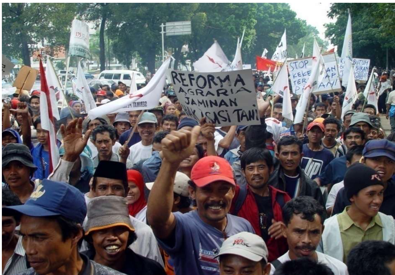
Land rights protest in Indonesia

The other shock was learn that, today, small farms have less than a quarter of the world's agricultural land – or less than a fifth if one excludes China and India from the calculation. Such farms are getting smaller all the time, and if this trend persists they might not be able to continue to feed the world.