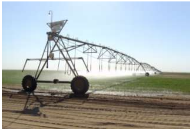
Centre-pivot irrigation, Algeria

And finally, also missing in our calculations is the recent wave of land grabbing that is now handing millions of hectares of fertile farmland to large corporations and depriving tens of thousands of farming communities of their livelihoods. Today's massive land grab took off only in the last decade and has yet to be captured in the official statistics.