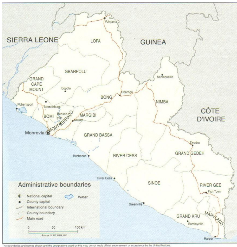
Fig. 1. County boundaries, Liberia.

commitments, and thus remain vulnerable to both chiefs and militia recruiters” (Richards, 2005, p. 587). Likewise the UN indicates that “[t]housands of disarmed former fighters from Liberia’s 14 year civil war are still roaming the country without training or reintegration into society, threatening Liberia’s chances of future stability” (IRIN, 2007). Indeed “reform of rural rights seems as urgent an issue as tracking the gun-runners or diamond- and timber-smugglers” (Richards, 2005, p. 588).