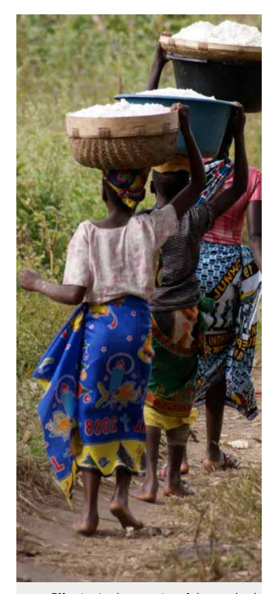
Effective implementation of the new land law is critical to Mozambique's ability to alleviate poverty and promote economic

Effective implementation and enforcement of this progressive and innovative policy and legal framework is critical to Mozambique's ability to reach its goals for poverty alleviation and economic growth. Civil society, donors and researchers are working with the government in Mozambique to address the gaps in implementation of the land law. This process has to be inclusive by building government and community capacity to administer and enforce land rights, providing financial and technical support for community land delimitation, and facilitating investor access to land on the basis of mutually beneficial partnerships with communities. Such an approach can generate equitable and sustainable development to transform the rural economy, end poverty, and ensure that everyone benefits from the land and natural resources that are, perhaps, Mozambique's greatest physical asset.