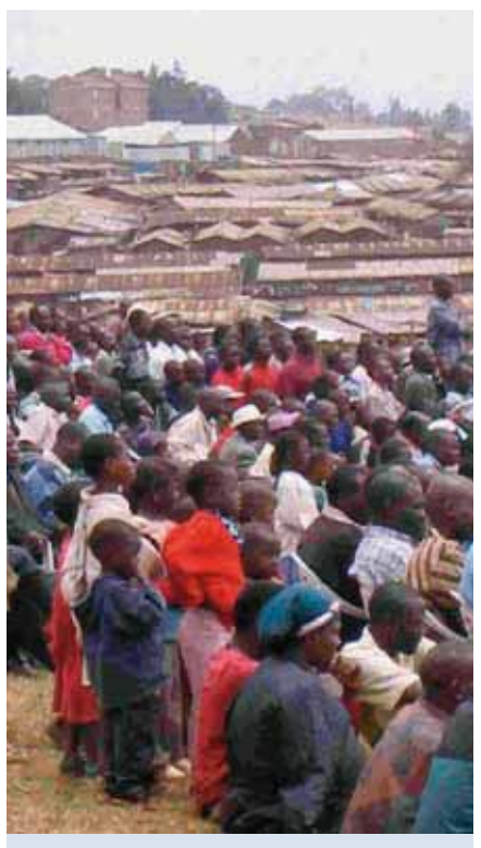
Stakeholders'meeting in Kibera slums, Kenya. Photo © U. Westman/ UN-HABITAT. 2005

While in the 1990 and 2001 slum estimation all pit latrines were considered not improved, the 2005 slum figures are not directly comparable to 1990 and 2001 figures.