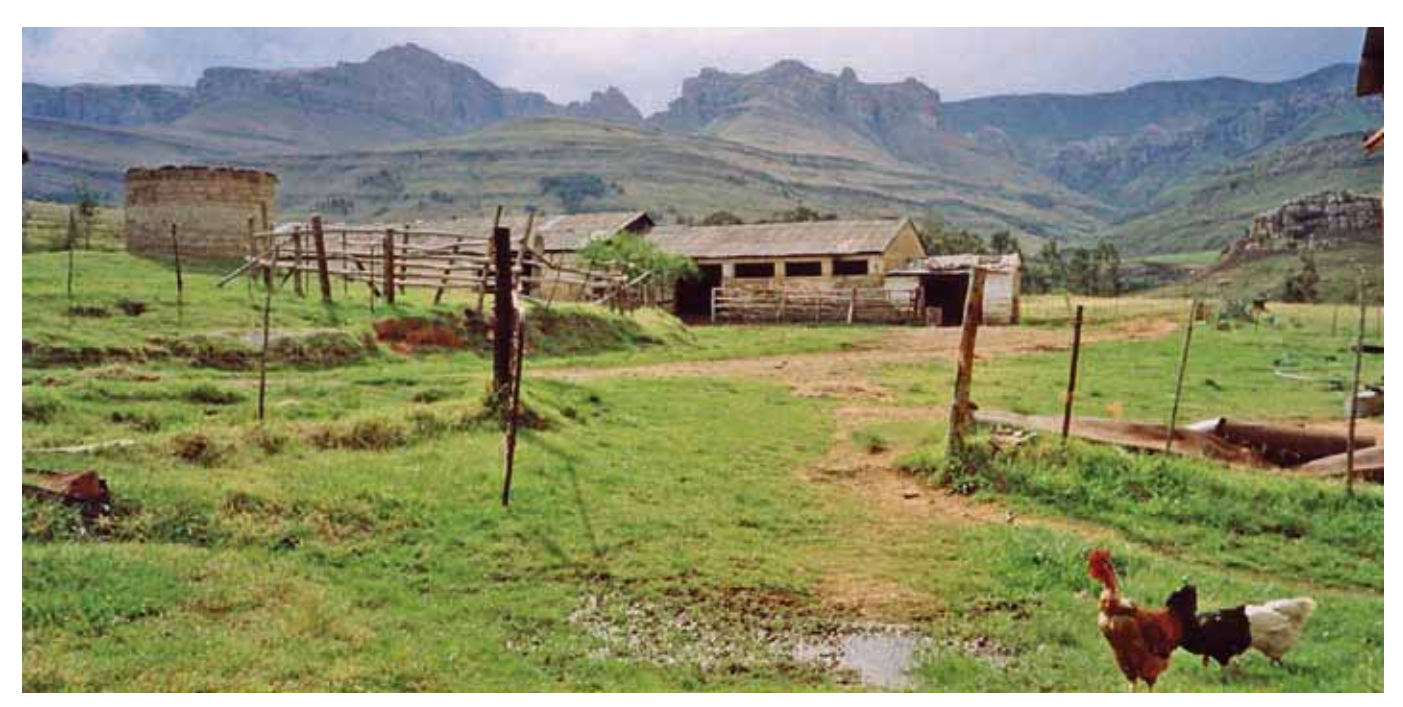
Land refom farm, E. Cape, South Africa.

Land governance must shift its emphasis away from currently dominant technical and managerial approaches to land tenure and administration, and towards approaches based on a better understanding of the political economy of land (e.g., the nature of vested interests and power relations, and their impact on land access and land rights as well as changing uses).