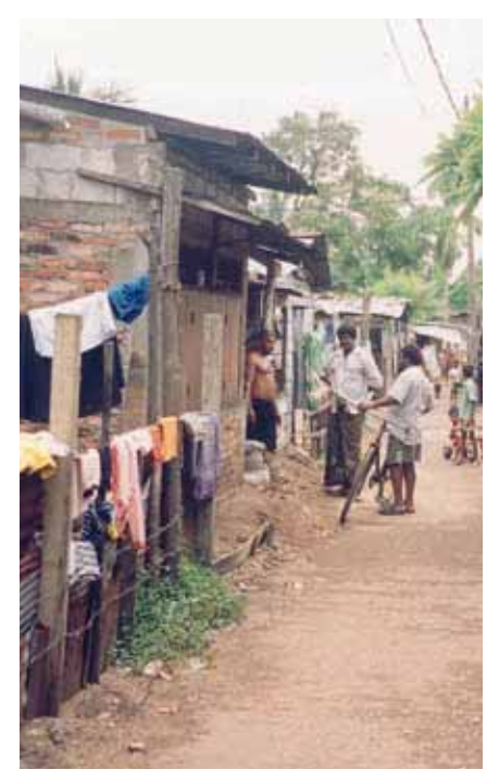
Sri Lanka.

required. Proclamations and moratoria differ from general amnesties in that they do not necessarily involve the formal recognition of unauthorized settlements; therefore, they enable the authorities to retain control over land whilst exploring equitable and cost-effective longer-term alternatives.