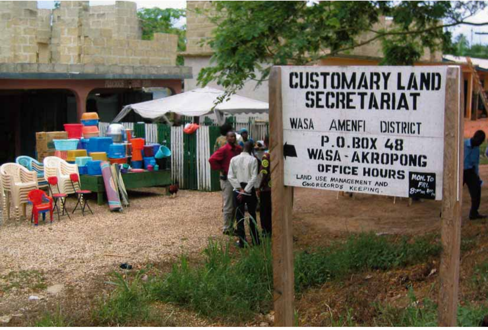
Customary Land Secretariat sign, Wassa Ghana.