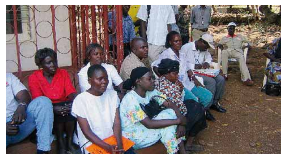
Community meeting in western Kenya

Once the general lines of policy and proposed legislation are in place, a pilot scheme or phased implementation can start. Pilots require careful monitoring of any new institutional arrangements, processes and technical systems so that lessons can be learned before undertaking detailed design, or finalising legal regulations prescribing new administrative procedures. UN-HABITAT has published a guide on 'How to develop a pro-poor-land policy'<sup>12</sup>.