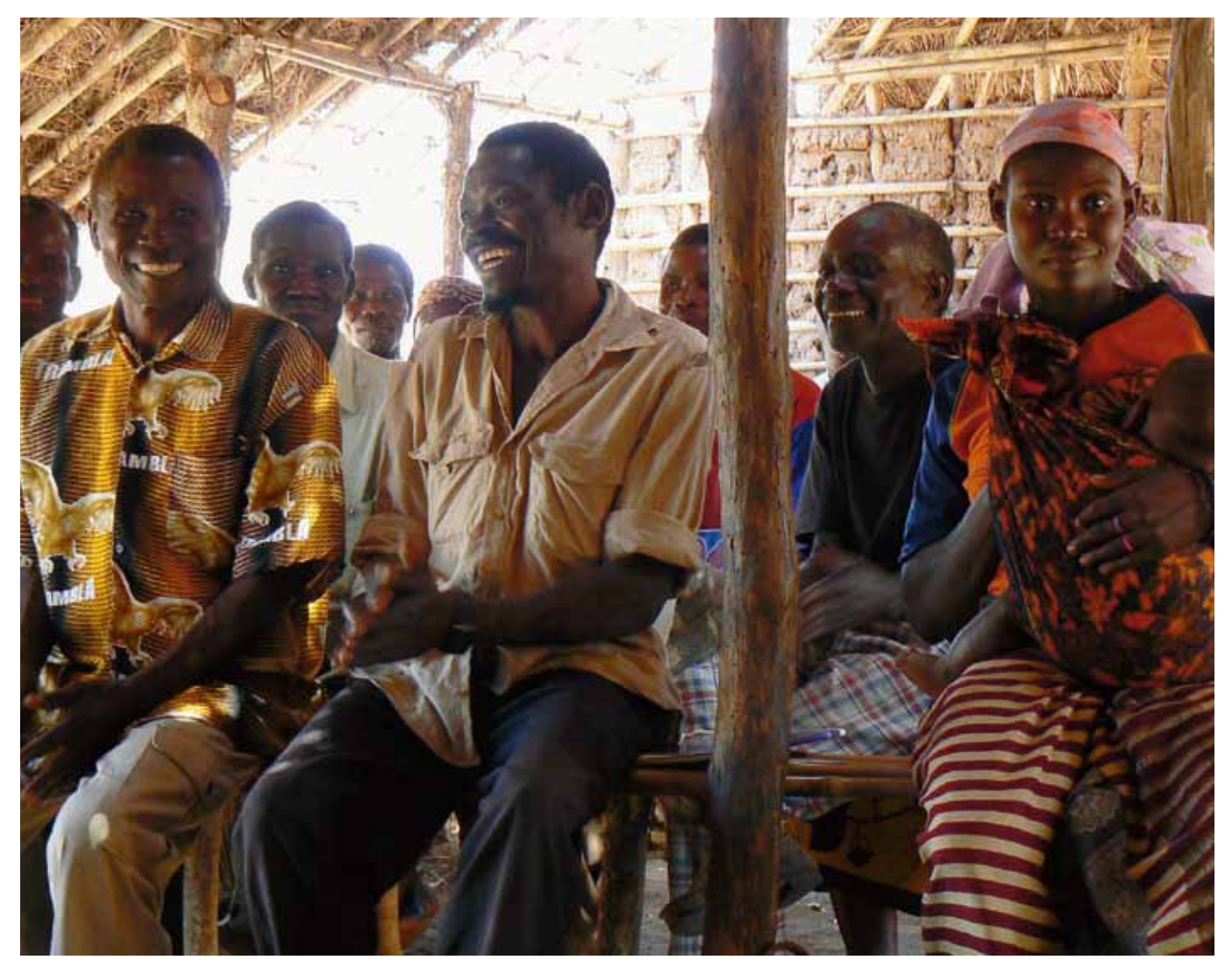
Community development council, Cabo Delgado, Mozambique. 2007

With land coming under pressure and competition, modern states require land policies to govern access, tenure, use and development. These take the form of land laws , rules and procedures as well as of specialist bodies for land administration . These bodies are in charge of land information systems linking land plots and their occupants or users. Area mapping and plot titling typically result in a cadastre , which ties land information to a parcel map or spatial data base.