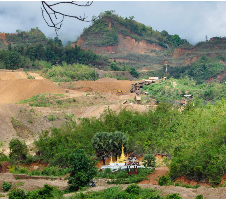
Heinda Tin Mine, Dawei, Myanmar.

In fact, out-migration of men comes up as a key alternative livelihood strategy with gendered implications as women who stay behind end up taking different roles while often not being recognized as heads of household. 33 Women also face increased care burden when they have to take care of sick family members due to pollution or injuries from hazardous working conditions which some refer to as “ women subsidizing the industry with their unpaid work ” (Samantha Hargreaves, WOMIN). Several respondents refer to the increase in (men’s) use of narcotics and alcohol as a hidden issue and an additional women’s burden with serious economic, community cohesion and health costs implications. The wider economic and social transformation affecting women’s and communities livelihoods’ insecurity as a result of environmental destruction and dispossession of natural resources is likely to have further long term, multigenerational implications that still need to be better understood.