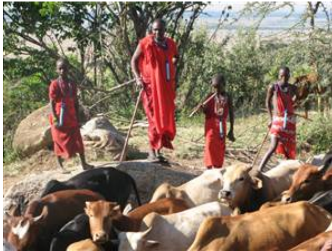
Figure 1. Massai elder with children at grazing cattle

Like many other African countries Tanzania is constantly under pressure both from internal and international environmental organisations, conservationists, hunters associations etc. to increase areas under conservation and to increase restrictions in areas already conserved. This is directly and indirectly reflected in recent policies and legislations like for example the Forest Policy of 1998, the Community Based Forest Management Guidelines of 2001, the Forest Act of 2002, the Environmental Management Act 2004, the Wildlife Policy of 1998, the Draft National Livestock Policy of 2005, the Strategic Plan for the Implementation of the Land Acts (SPILL, URT 2005d). Establishment of Game Reserves and conservation are frequent sources of conflicts in many parts of Tanzania.