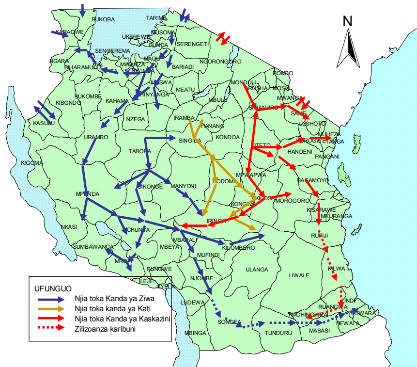
Figure 5 Southwards pastoral migration routes in Tanzania