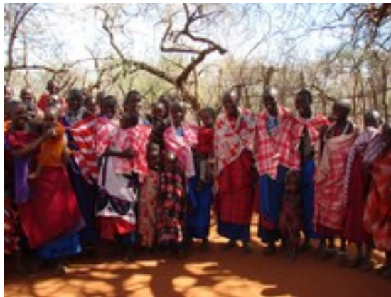
Figure 2: A Maasai women community

Furthermore, inadequate recognition of pastoralism and the pastoral way of life in national policies has resulted in a great deal of conflict, mainly over land issues. This, in turn, has contributed to a negative state perspective on the pastoralist culture, way of life and its value as an economic activity.