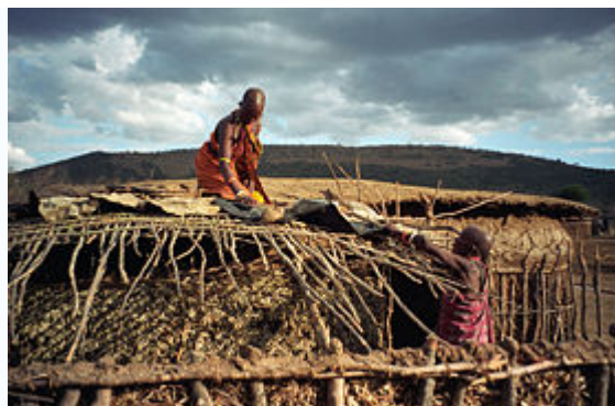
Figure 6. Masai women repairing a house in Masai Mara (1996)

Gender needs and interests are influenced to a great extent by gender roles and relationships. Men and women play different roles. There are three main categories of gender roles: productive, reproductive and social/community tasks. A typical example of differential gender roles is given by the Massai pastoral community. Maasai life is one of domestic industry in which they produce most of what they use to live themselves. For example men are responsible for making spears, shields, clubs and machetes while women are responsible for beaded ornaments worn by both men and women. These are examples of different gender roles. Also, their living quarters, called Inkajjik, ( Figure 6 ) are built by the women of the society using mud, sticks, grass and cow dung while the fences that protect the houses are built by the men using different types of trees.