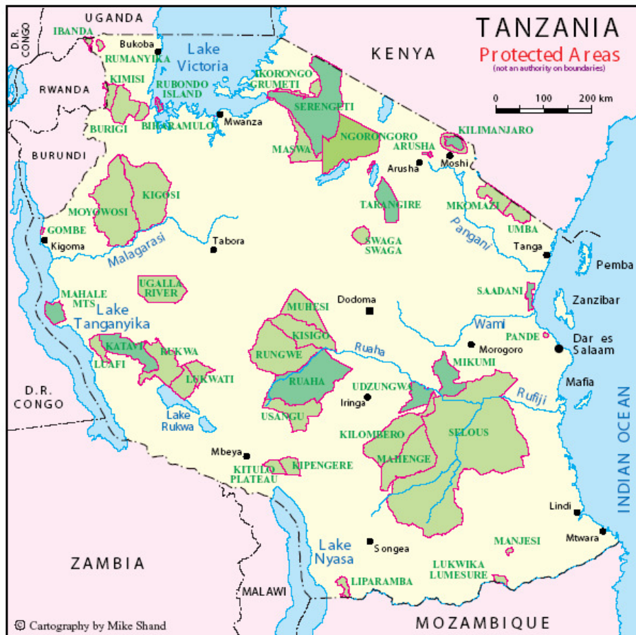
Figure 4 Wildlife Protected Areas of Tanzania

The pastoral people in Tanzania have been the most prominent victims of protected areas and wildlife conservation policies and practices widely acknowledged today. In pre-colonial times, the Maasai and other pastoral groups controlled a vast area stretching from central Kenya to central Tanzania. Today, they occupy less than two thirds of their former territory and there are indications that this will go on dwindling (Kaare, 1996, Okoth-Ogendo, 1992). Wildlife conservation policies, characterized by the creation of exclusive wildlife protected areas, and state-sponsored agriculture - both large and small scale - and commercial ranching have been responsible for this plight of the pastoral peoples in dry land ecosystems of Tanzania (Lane, 1991, 1994, Scoones, 1995, Mustafa, 1997).