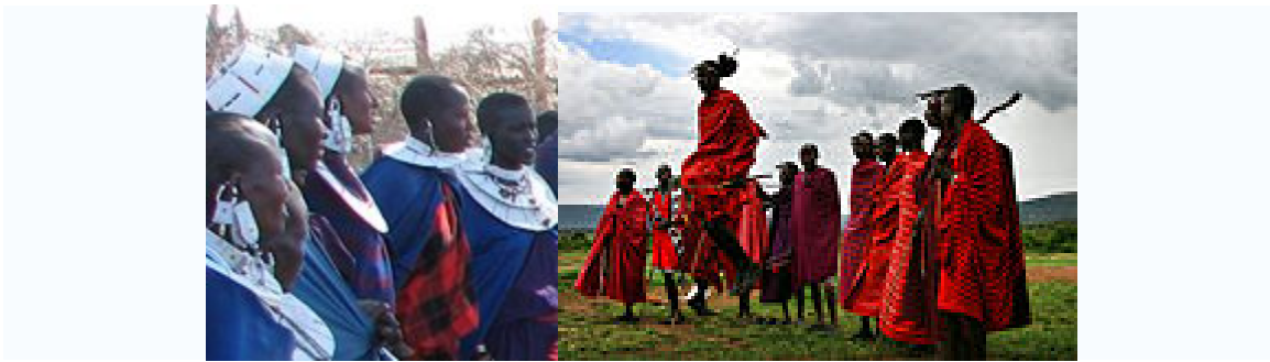
Figure 7. Maasai men and women singing and dancing

one unanimous call in acknowledgment, and the olaranyani will sing a verse over the group's rhythmic throat singing. Women sing lullabies, milking songs, and songs praising their sons. Nambas, the call-and-response pattern, repetition of nonsense phrases, monophonic melodies repeated phrases following each verse being sung on a descending scale, and singers responding to their own verses are characteristic of singing by females. One exception to the vocal nature of Maasai music is the use of the horn of the Greater Kudu to summon morans for the Eunoto ceremony. Unfortunately, because of their movement to new areas where they interact with different people, such systems of culture are slowly disappearing.