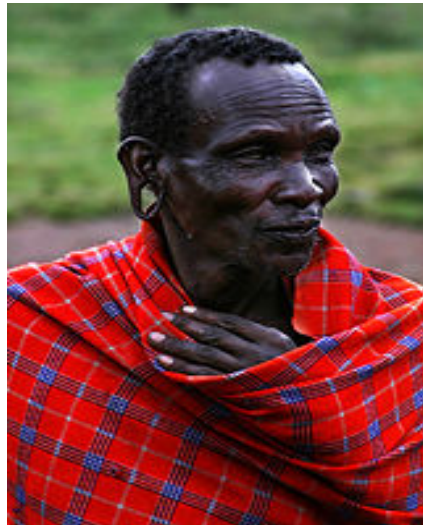
Figure 8. Maasai elder with stretched earlobes

region, and which is thought to contain 'worms' or 'nylon' teeth. This belief and practice is not unique to the Maasai. In rural Kenya a group of 95 children aged between six months and two years were examined in 1991/92. 87% were found to have undergone the removal of one or more deciduous canine tooth buds. In an older age group (3-7 years of age), 72% of the 111 children examined exhibited missing mandibular or maxillary deciduous canines. However, this practice is slowly disappearing as more women attend clinic for health care and more children go to school