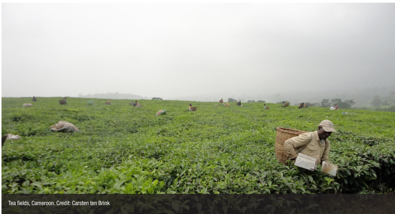
Tea fields, Cameroon.

at the time of the original land acquisition. Companies should also provide an open and accessible grievance mechanism for communities to voice their concerns before these escalate.